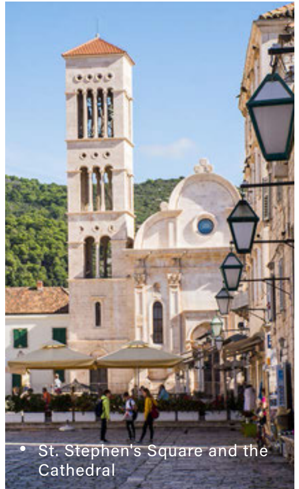
• St. Stephen's Square and the Cathedral

To get the most out of a trip to Hvar and Pakleni Islands, here are some tips for exploring these destinations: take a tour of the old town of Hvar and its historic sites, like St. Stephen's Square and the Cathedral. Explore the Fortica Fortress. Hop on a boat tour to discover hidden coves and secluded beaches around the Pakleni Islands; visit Stari Grad for its ancient castles, churches, and monasteries; sample the local flavors with traditional dishes like black risotto or grilled fish; enjoy cultural events like the Hvar Summer Festival; and explore nightlife spots like Carpe Diem or Veneranda Club.