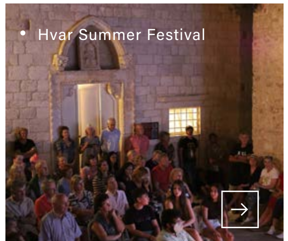
• Hvar Summer Festival

DISCOVER THE FLAVORS AND TRADITION OF HVAR AND PAKLENI ISLANDS